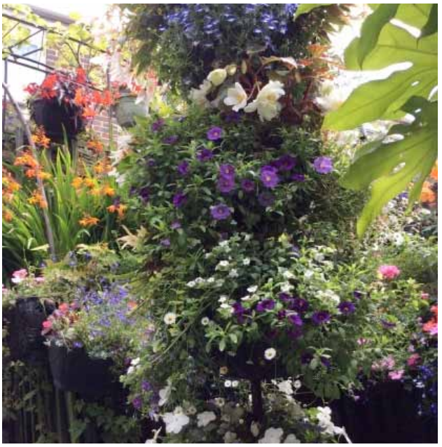
Isabell Bourke, Best Hanging Basket -Gold Winner 2017