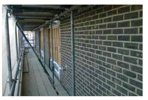
Brickwork at Ramilies House