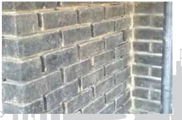
Brickwork at Ramilies House

Work was delayed by the weather however all the work will be completed before the Summer.