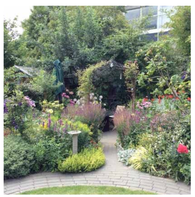
Kerry Littleales, Best Back Garden -Gold winner 2017