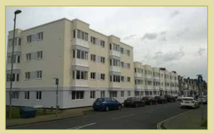
Completed works at Hove Court.

We are finalising the tender for selecting a contractor for the refurbishment at Gloucester House. Once finished, the scheme will be of a similar standard to the other sheltered schemes that have been recently upgraded.