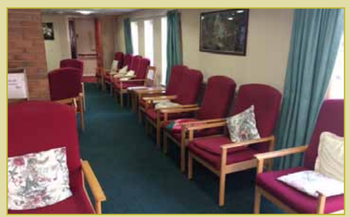
Communal lounge requiring refurbishment.