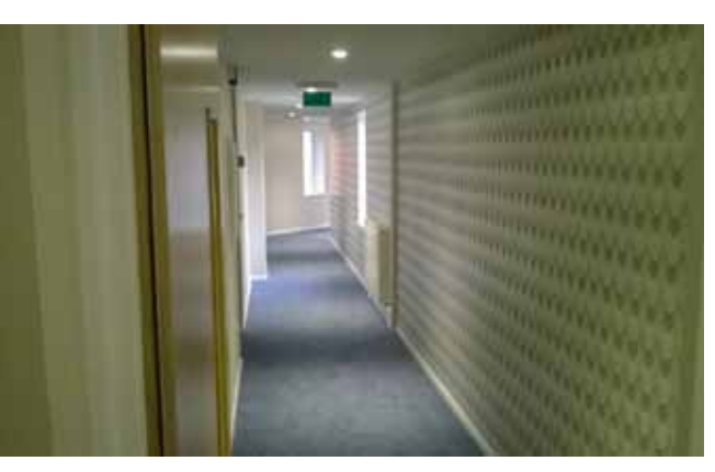
Completed halls with new carpet, wallpaper and oak style doors

For more information contact Karen on 07947 955865 or visit www.brendoncare.org.uk/clubs