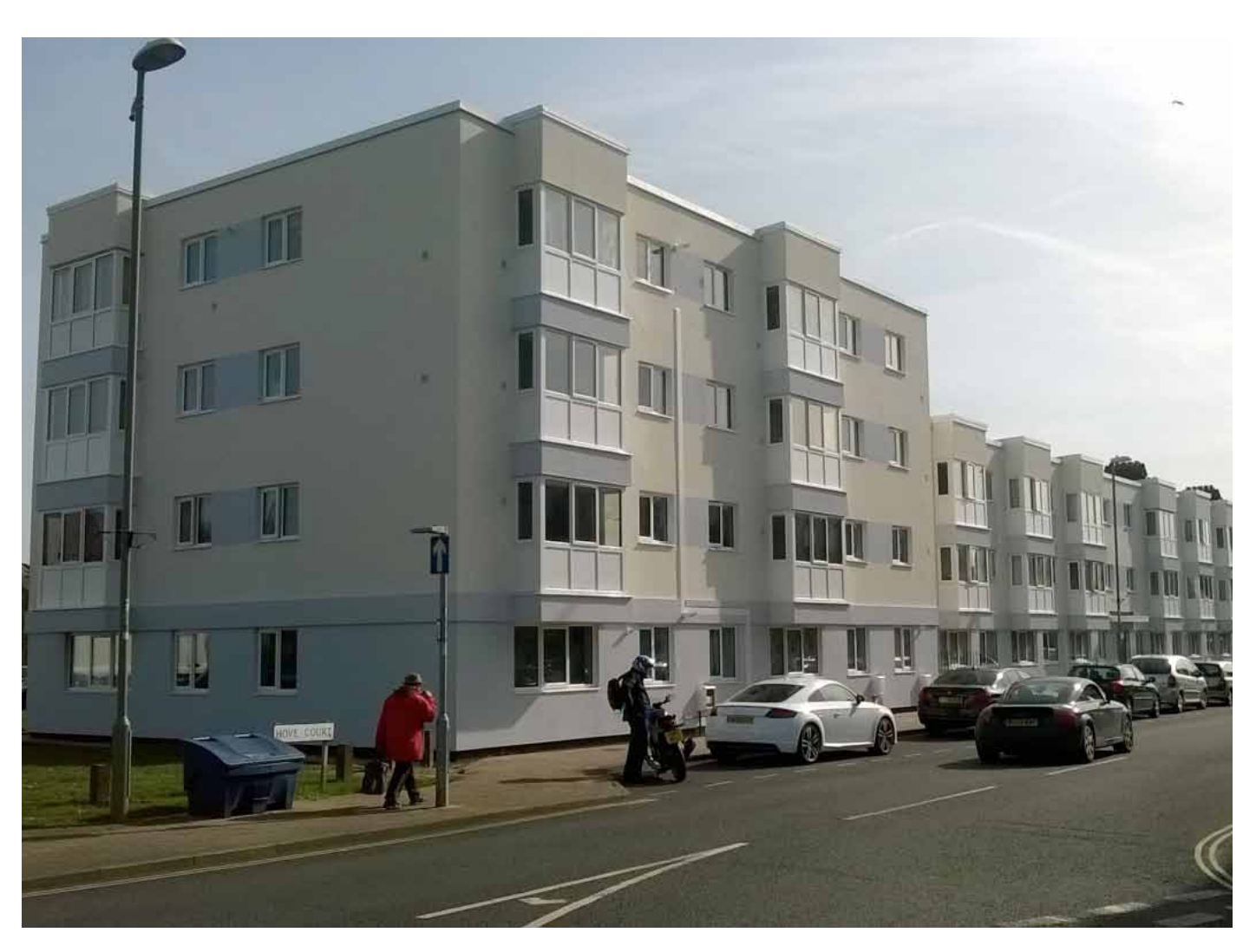
Hove Court looking splendid