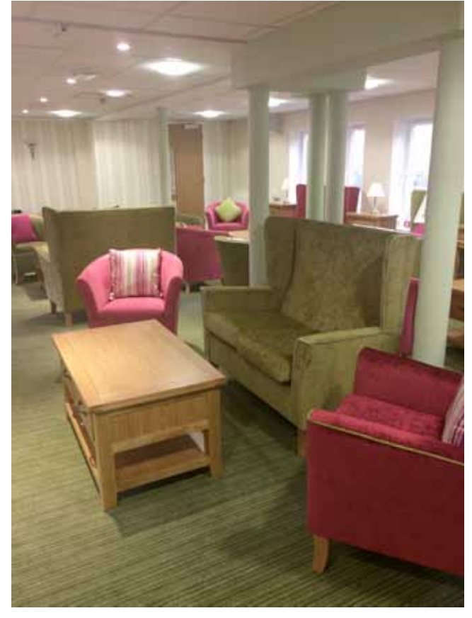
Gloucester comunal area after