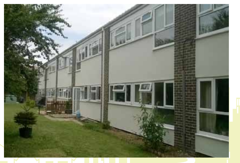
The other end of Glebe Drive already completed.