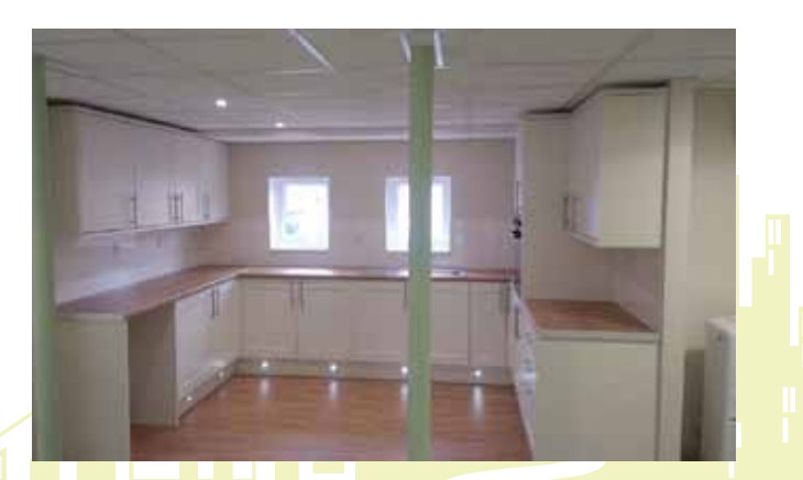
Completed kitchen at Gloucester House