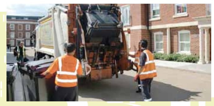
Urbaser working hard in the borough

Wheelie bins/waste sacks will be collected from the edge of your property. If you are unsure where to leave your rubbish, please contact Streetscene on 08000 198 598.