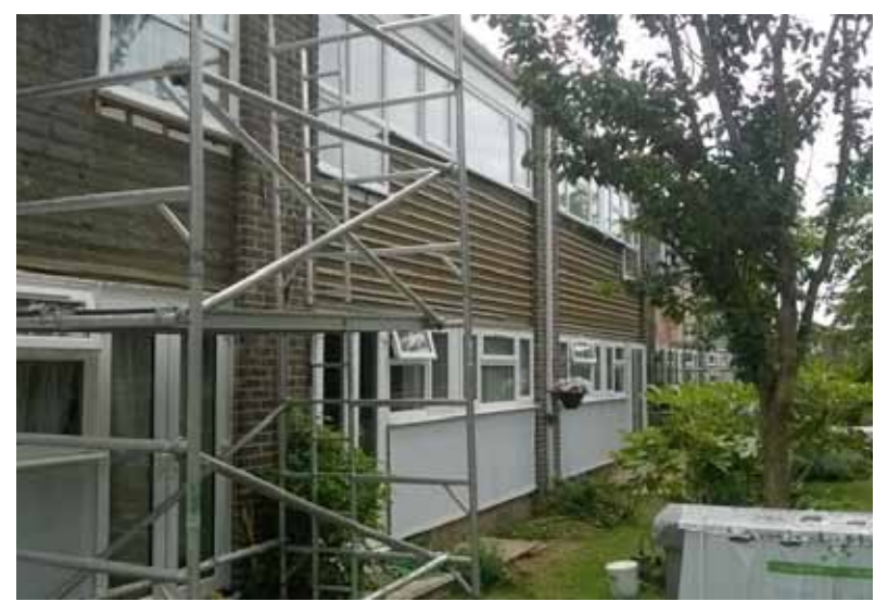
One end of Glebe Drive with wall insulation in progress

Roof at Archer House gearing up for a top coat despite those heavy clouds!