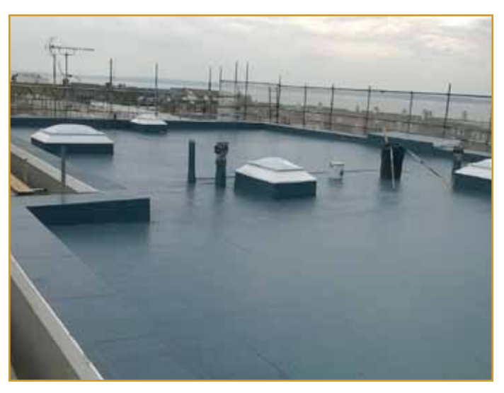
Completed roof at Hove Court