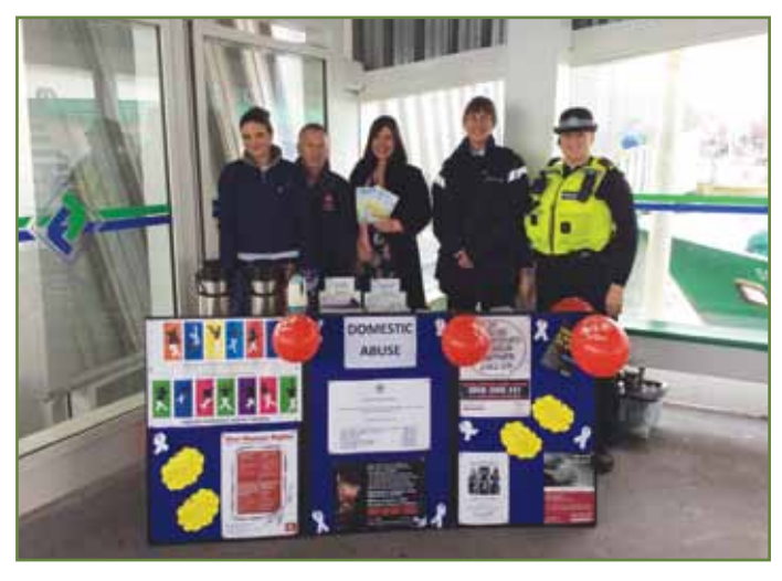
Raising awareness for White Ribbon Day

The Office for National Statistics reported findings from the 2013/14 Crime Survey for England and Wales (CSEW) that 28.3% (4.6 million) of women and 14.7% (2.4 million) of men had experienced domestic abuse since the age of 16.