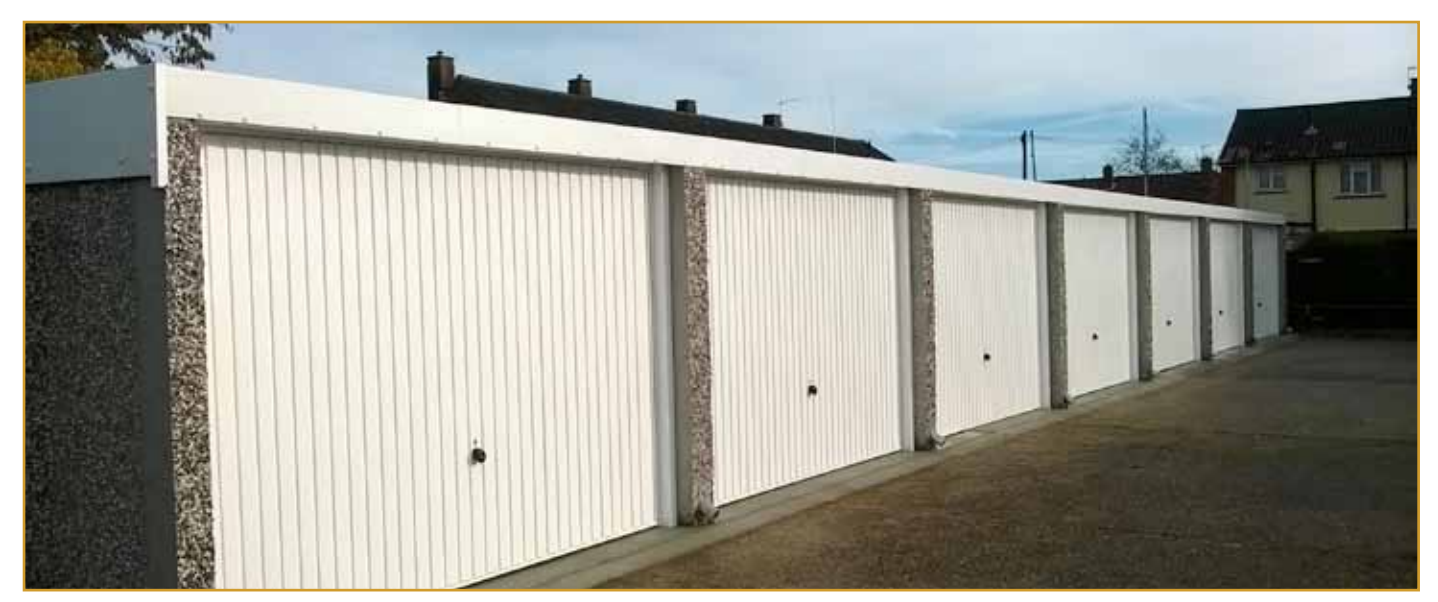
New garages in Gosport