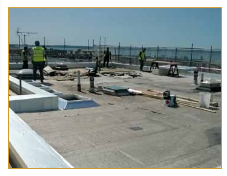
Hove Court roof undergoing repair

The extent of the works were to improve the overall thermal efficiency of the block by upgrading walls, replacing a leaking roof and where possible the windows too. Works started just before April 2016 and are progressing really well. We should have the work completed by the end of December.