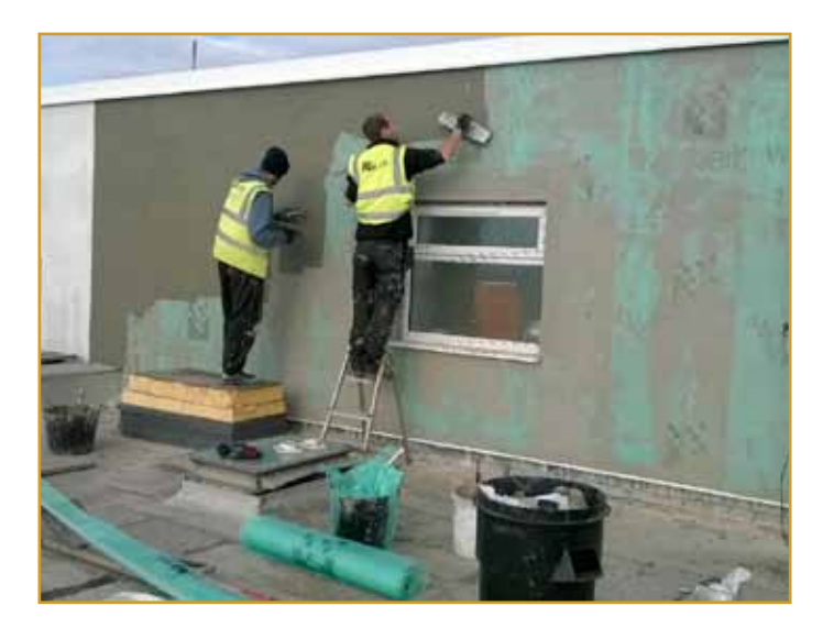
Wall insulation being applied at Hove Court