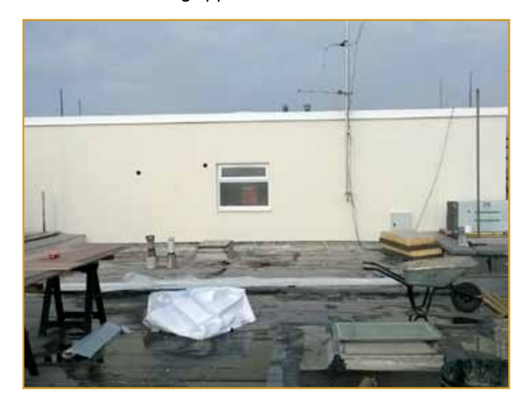
Finished wall insulation at Hove Court