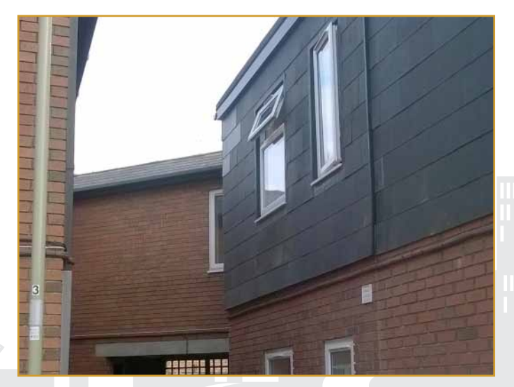
Gloucester House showing completed extension work