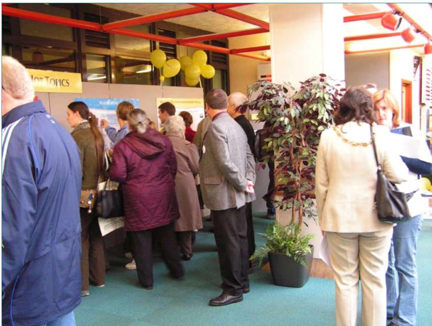
Vision Event, December 2006