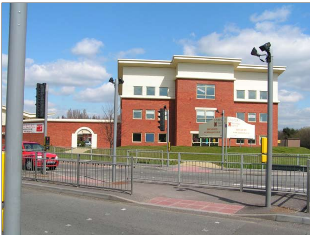
Gosport Business Centre, Frater Gate Business Park, Aerodrome Road

Back page picture: Falkland Gardens, Gosport Ferry