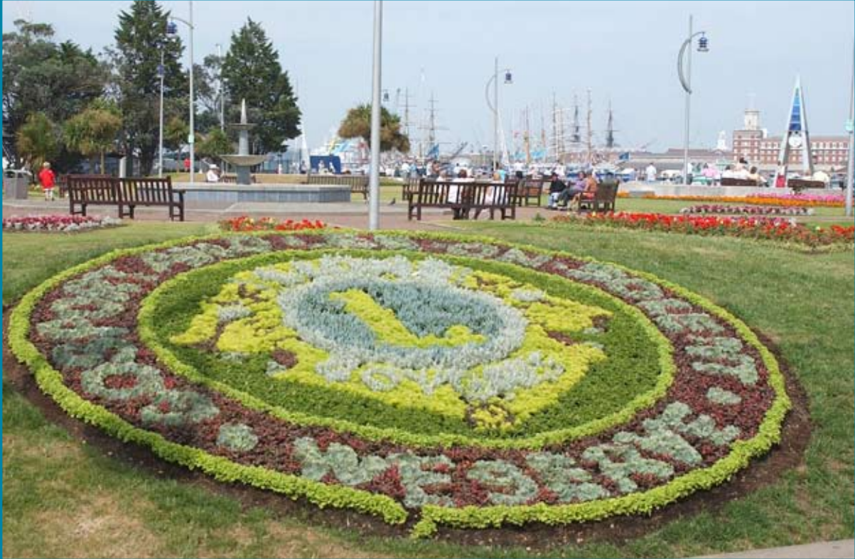
Falkland Gardens, Gosport Ferry

If you need this document in large print, on tape, in Braille or in other languages, please ask.