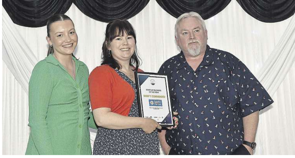
Daisy First Aid, highly commended in the Start Up Business of the Year award

envronment. They are actively involved in the Gosport community with organising and being part of local activities." Also commended were Jones' Creative Services Ltd and Imagistic.