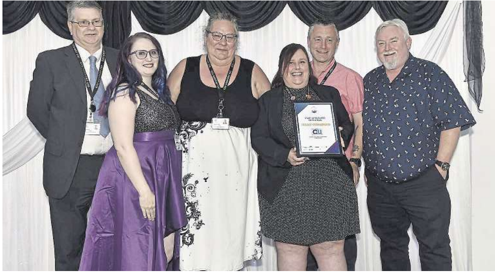
C2U Gosport CIC highly commended in the Start Up Business of the Year award