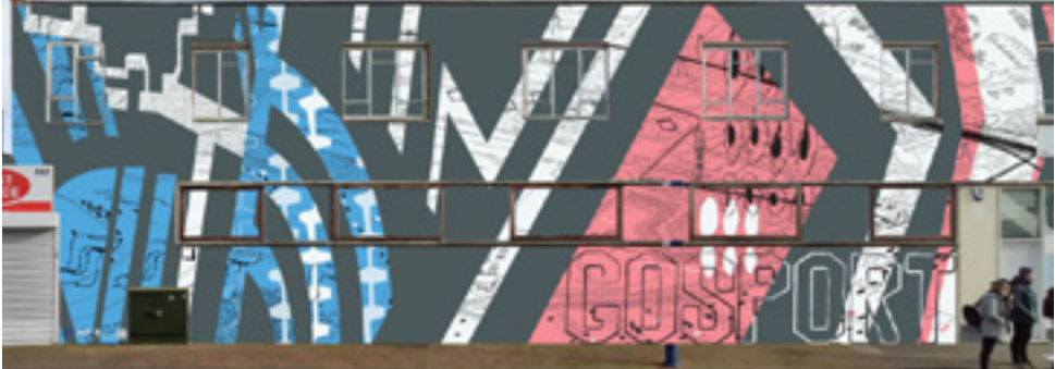
Top image: Bus station mural. Bottom image: The design for the High Street mural.

Two bold murals inspired by Gosport's heritage are bringing new colour to the town centre. One can be seen on the waterfront side of the bus station. And as Coastline went to press, a design for the corner of the High Street and South Cross Street was being completed. The work has been supported by the government's Welcome Back Fund.