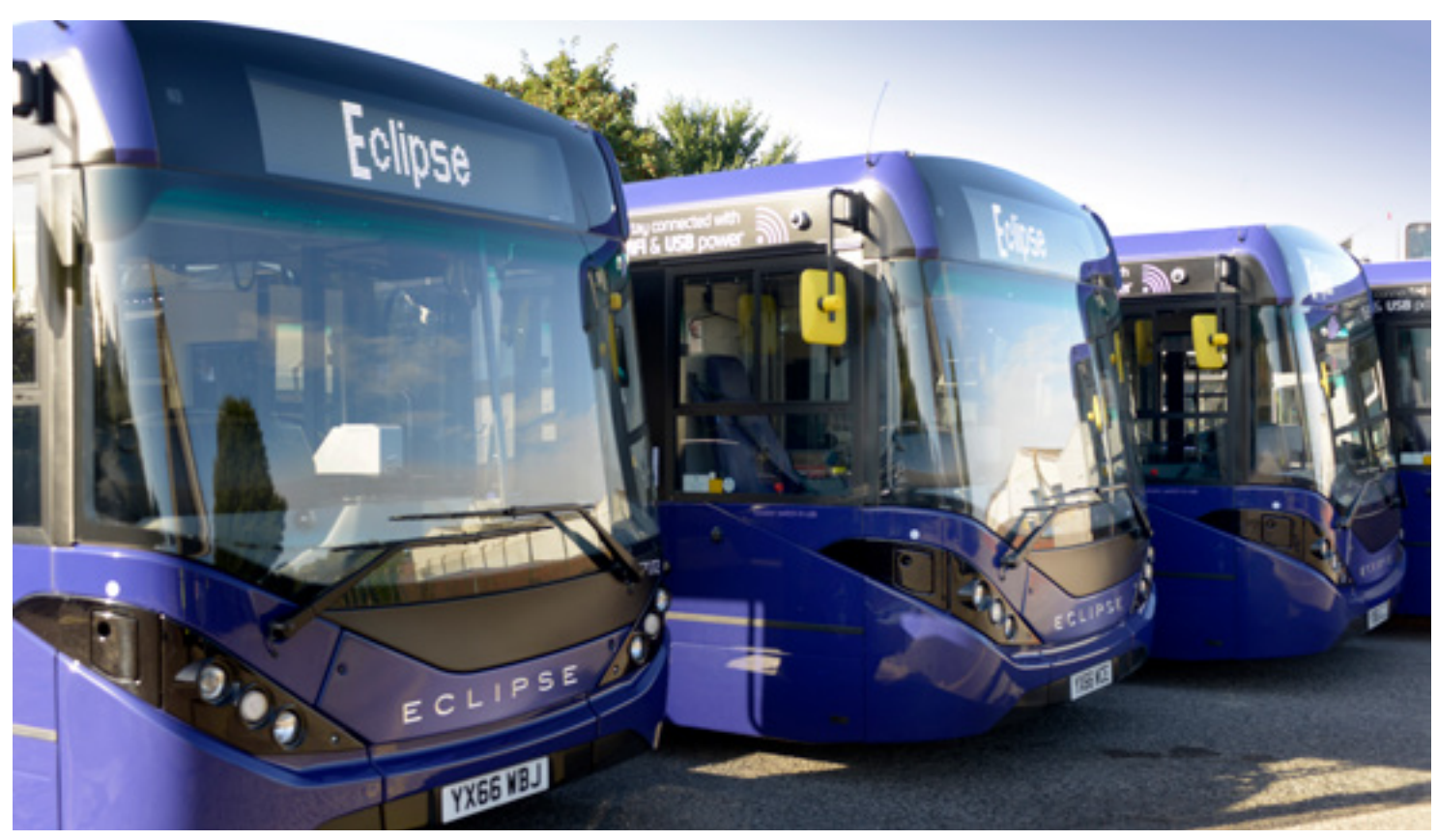
The new station will complement the Eclipse bus service