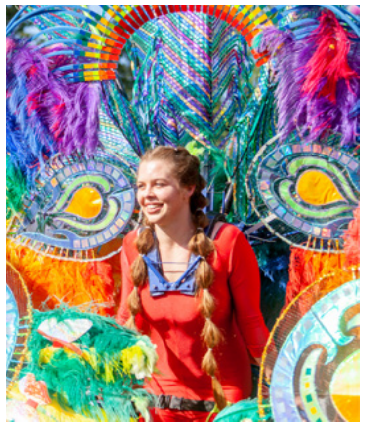
Recent Shademakers events

Meanwhile, we're working with artists and business to bring more colour and interest to the town centre. Look out for large-scale murals reflecting the heritage and stories of Gosport on walls and in shop windows.