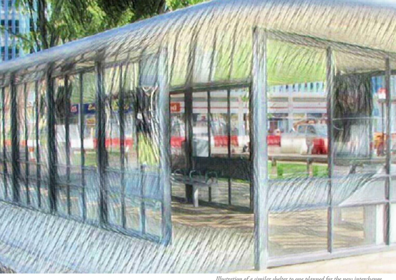
Illustration of a similar shelter to one planned for the new interchange