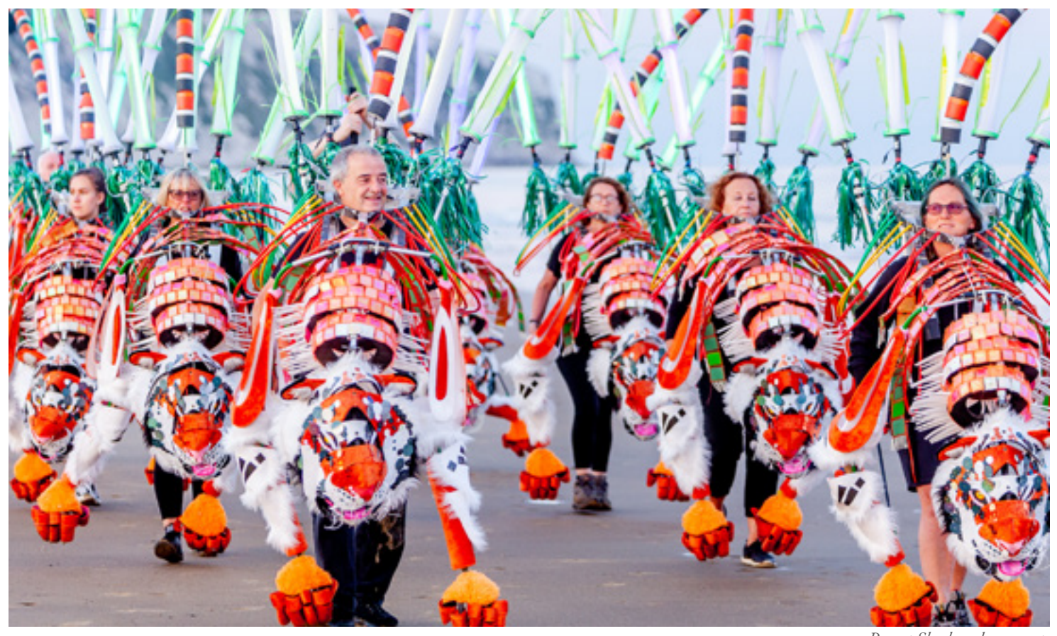
Recent Shademakers events

We're busy with lots of projects aimed at brightening up Gosport with art and events, and caring for our history.