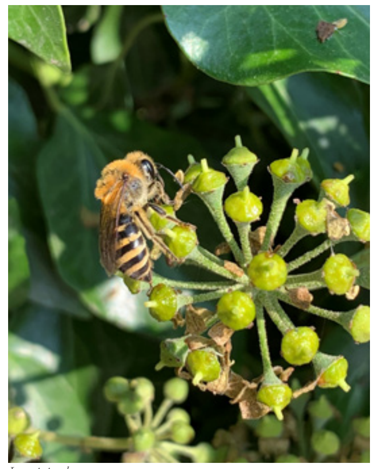
Ivy mining bee

Waitrose, the garden centre and a regular visitor have supported the project by buying wildflower seeds and paying for essential work. Our volunteers have worked hard on clearing scrub and raking, and will be sowing seeds on warmer spring days.