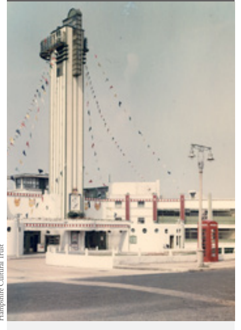
The Lee Tower, which stood on Lee-on-the-Solent seafront from 1935 until 1971, is shown here decorated to celebrate the Queen's coronation in 1953.

We're encouraging residents to celebrate the Queen's Platinum Jubilee, marking 70 years of Her Majesty's reign.