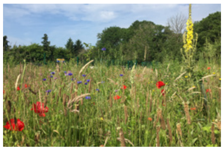
Wildflower meadow near Grange Farm

Here, and in the Wildgrounds, areas are also being set aside as nesting locations for mining bees, using gravelly soil from the garden centre site.