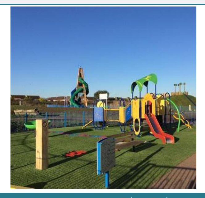
Improvements to Privett Park

Completed 2013/14 / cost £250,000 from developer contributions. The scheme saw the replacement of a poor condition paddling pool with a new outside play facility with traditional all year round play equipment and summer water features. Known as 'Gosport Splash Park'