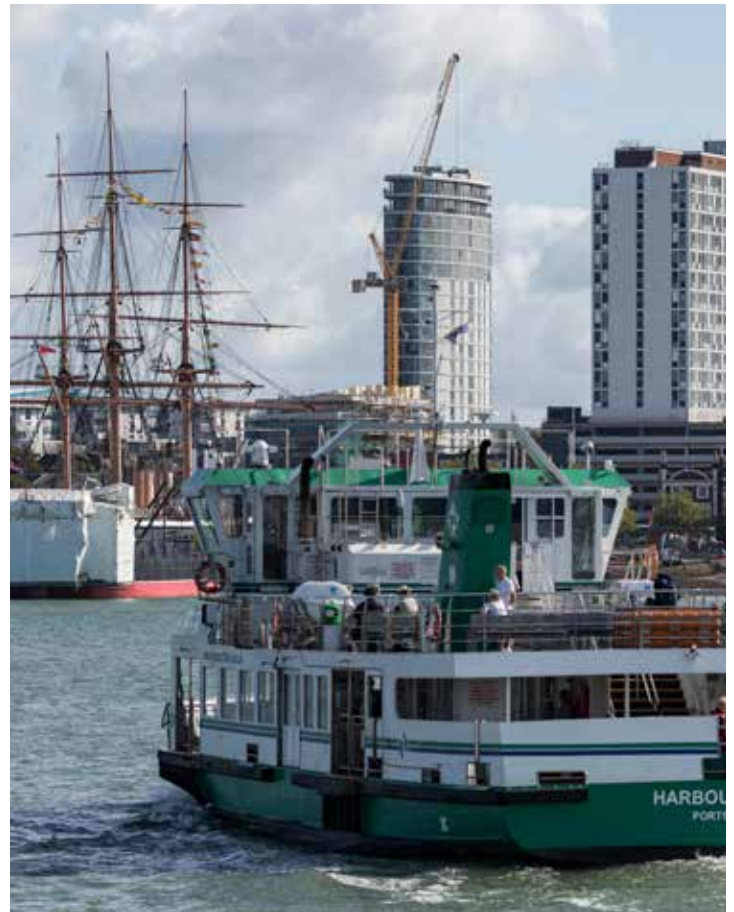
New development will make the most of Gosport's transport links

Better links between Gosport, Fareham, Havant, Waterlooville, Ryde and Portsmouth will help boost the local economy, open up jobs, provide better access to services and support a greener recovery from the coronavirus pandemic.