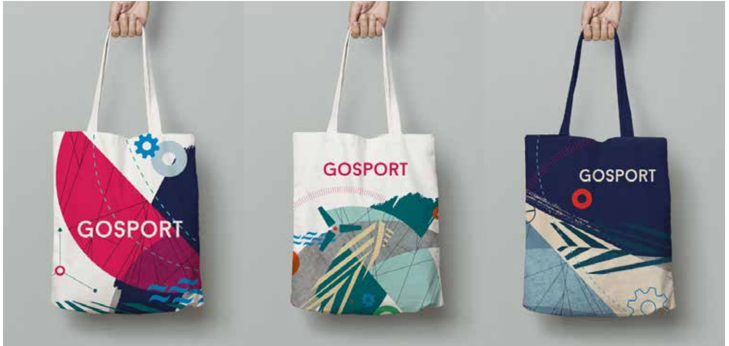
A mock-up showing how the new visuals could work on shopping bags

To find out more about using the story, photography and graphic design, contact us at business@gosport.gov.uk