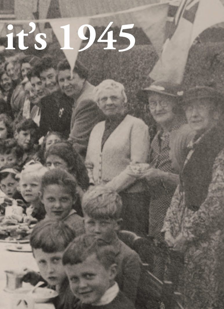
The News, Portsmouth