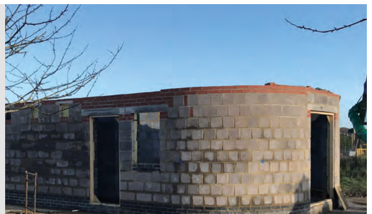
The café building taking shape earlier this year

Alver Valley has seen a lot of improvements lately, including better parking and the new adventure playground.