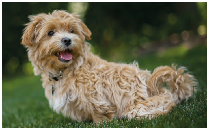
Dog show, 23 May

Last date for entries to our 2020 Gosport and Lee-on-the-Solent in Bloom gardening competition. You can enter online – search in bloom at www.gosport.gov.uk Or pick up a entry leaflet from reception at the Town Hall.