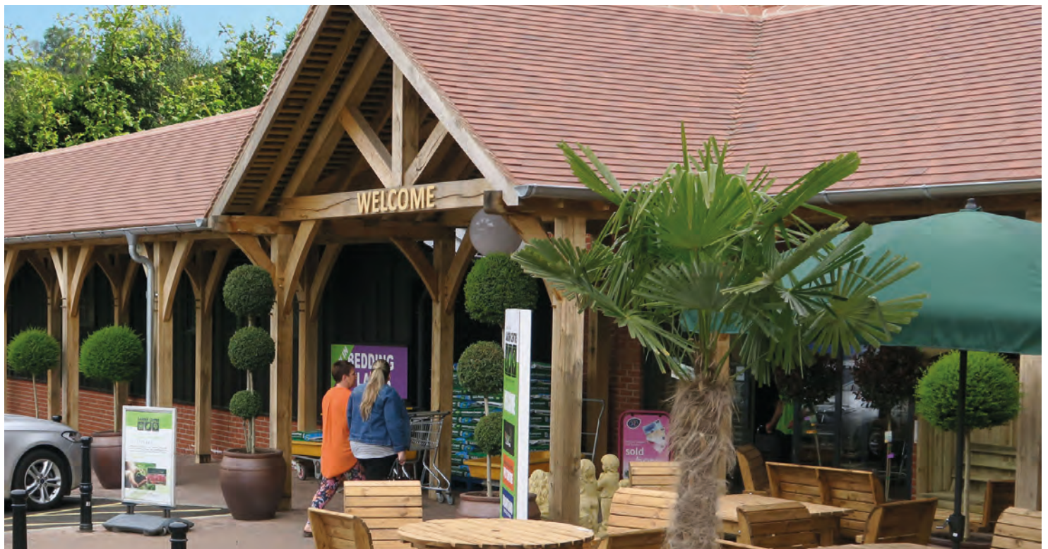
MGGC's garden centre in Warwickshire

“Alver Valley is such an important green area for the people of the borough, and this development would make it an even more attractive and enjoyable place to visit.”