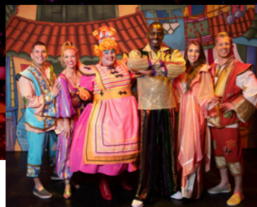
Cast of Aladdin