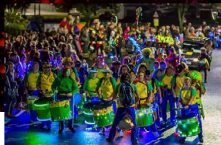
Big Noise Community Samba Band