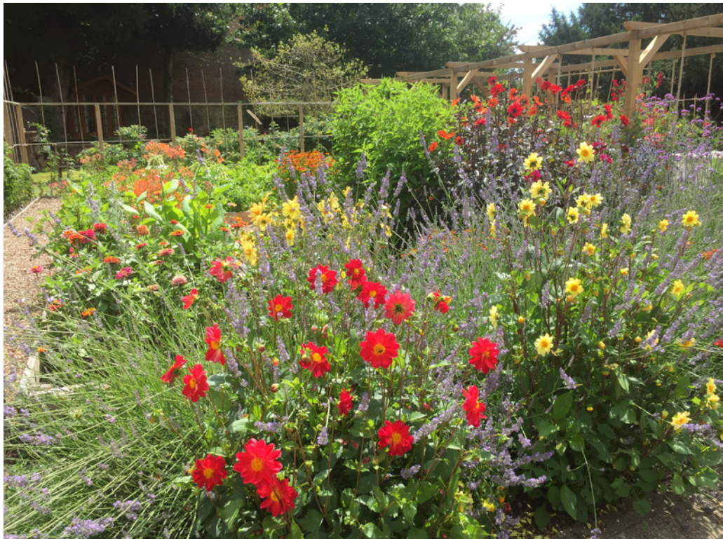
Shore Leave Haslar's winning garden