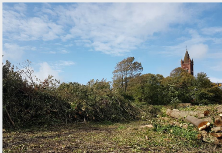
Work under way

As a first step we've cleared shrubs and selected trees, re-seeded some areas and mended fences, using money from the government's Coastal Revival Fund. The next stage of work will mean more extensive restoration and installing information panels.