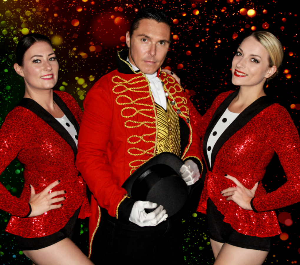
The Greatest of Shows