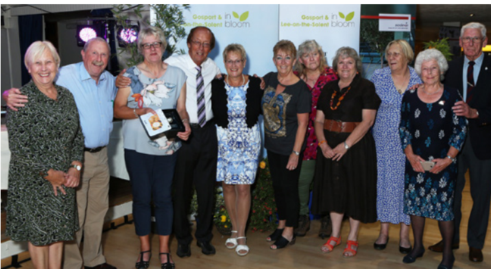
Shore Leave Haslar volunteers

The competition is sponsored by A&S Motors, Sodexo, Hambrooks, Huhtamaki and Urbaser.