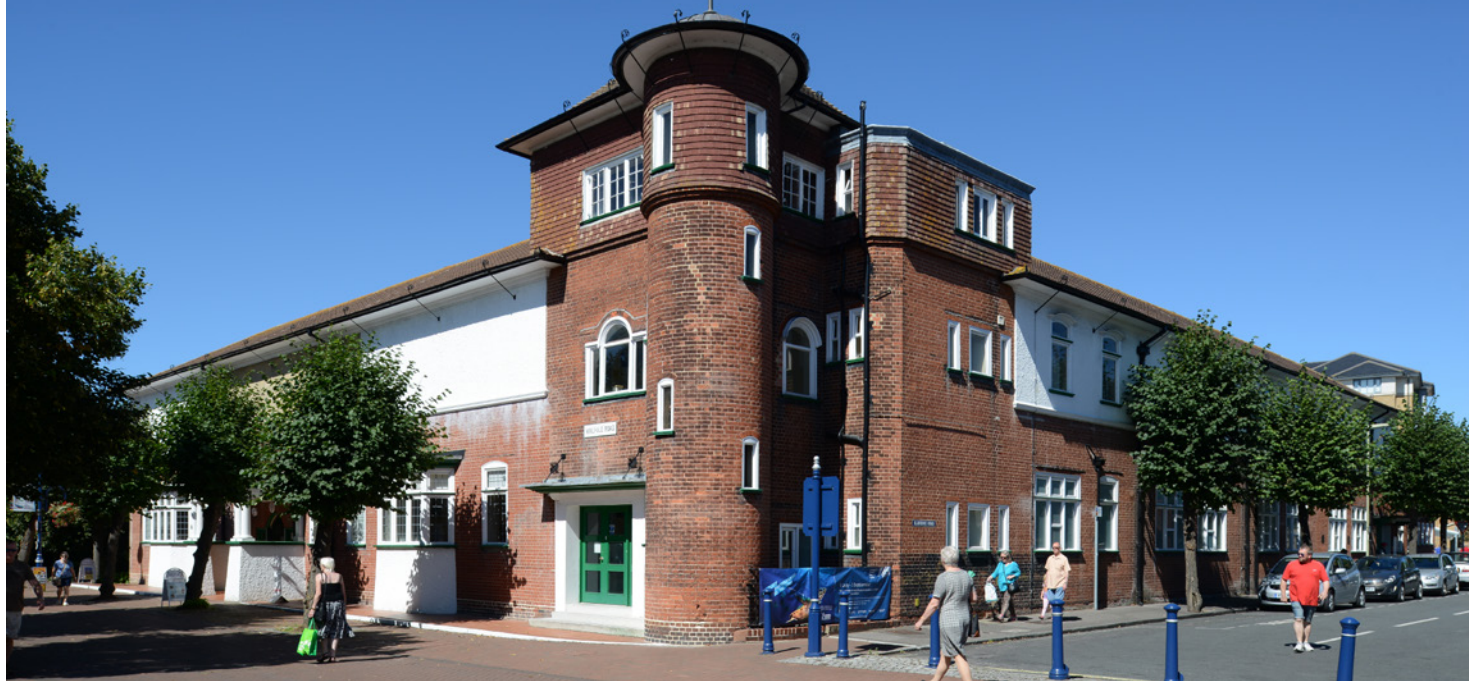
Old Grammar School

A major plan to transform Gosport's town centre is being drawn up, with new uses for empty historic buildings, more options for eating out, and more community and cultural events.