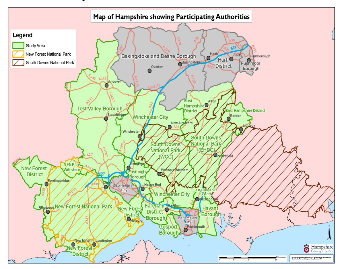
Plan 1: The Study Area