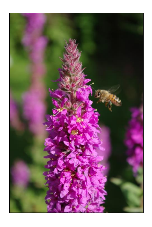
A RE-CREATED REGENCY GARDEN